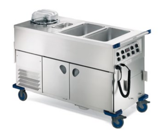
FOOD SERVING CART SAG 2-THK