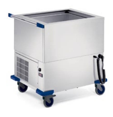
CONVECTION-COOLED FOOD TRANSPORT CART SAW 2-UK