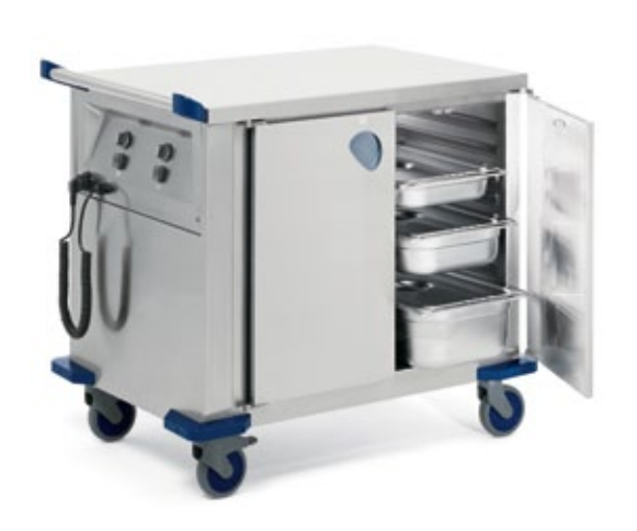
FOOD TRANSPORT CART STW 2 with accessories