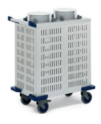
PLATE DISPENSERS 2 SEK 21-26 with accessories