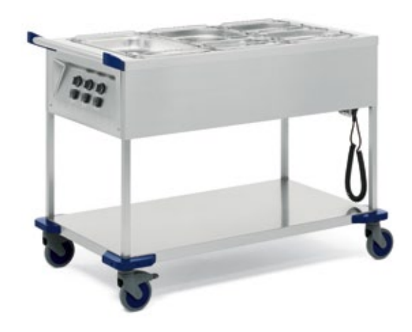
FOOD SERVING CARTS SAW 3 with accessories